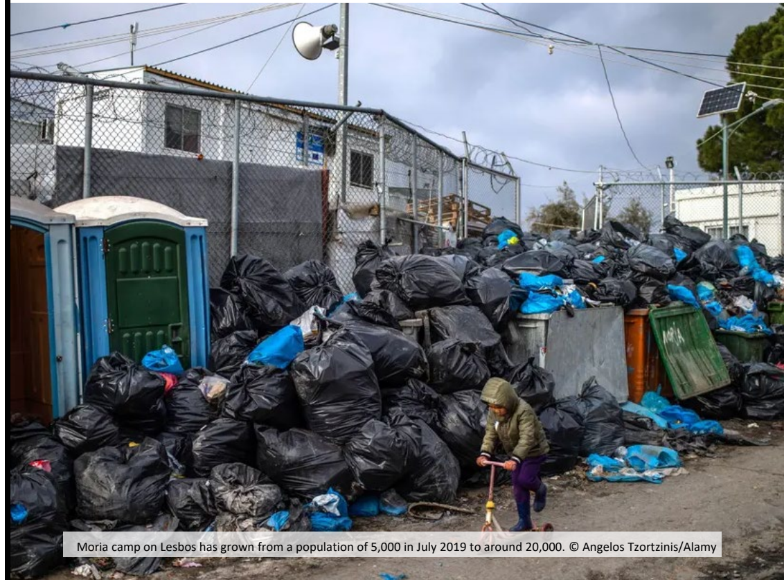
Moria camp on Lesbos has grown from a population of 5,000 in July 2019 to around 20,000.